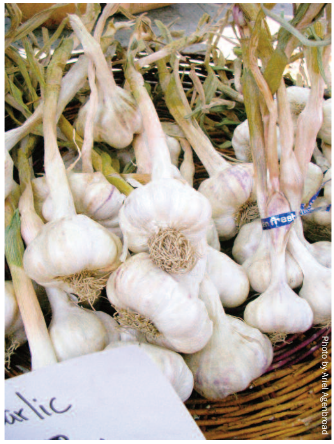
Planting garlic bulbs bought in grocery stores in home gardens is illegal in Idaho, an effort to protect commercial crops from disease. Instead, plant only true seeds or stock grown in one of the 21 Idaho/Oregon counties where crops are inspected and certified to be free of white rot.

White rot ( Sclerotium cepivorum ) is a fungal disease of onions that occurs throughout the world. It is through infected sets, transplants, cloves, bulbs or bulblets that the white rot fungus can be brought into the state.