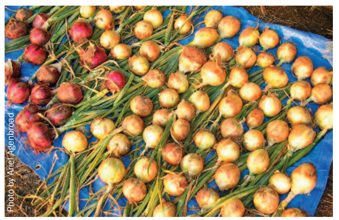
Many home-grown onions often are from sets, or tiny onion bulbs. Idaho quarantine laws require that in Idaho all sets must be certified as disease free. Or, plant from seeds.

The fungus forms sclerotia, or hard black "resting" structures that can live in the soil for up to 30 years. Only Allium species (such as onion, leek, garlic, and shallot) are susceptible. The disease is spread by water, wind, farm machinery, and plant material. Once the disease is in a field, growing Allium species in that location is extremely difficult. The only truly successful method of control is to prevent the fungus from ever entering a growing area.